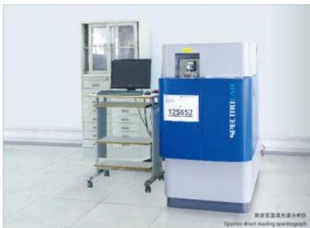
斯派克直读光谱分析仪 Spectro direct reading spectrophotometer