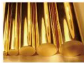
圆铜棒 Round bar