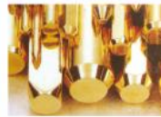
六角铜棒 Hex bar